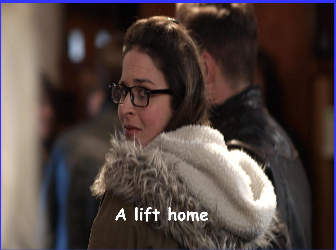
A lift home