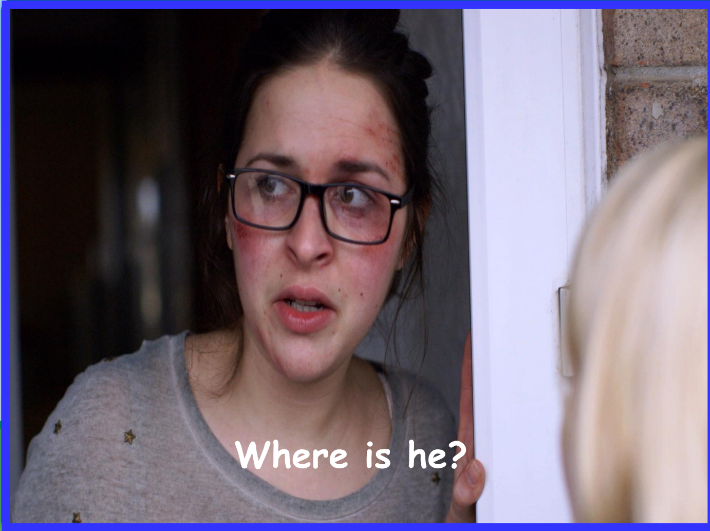
Where is he?